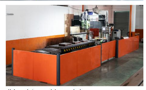
KEFAN Metal parts fabrication plant workshop & Airconditional Assembly workshop.

Website: www.kefanrobot.com. Tel: 0086-13857893619 / Email: info@kefanrobot.com