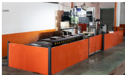
KEFAN Metal parts fabrication plant workshop & Airconditional Assembly workshop.

Website: www.kefanrobot.com . Tel: 0086-13857893619 / Email: info@kefanrobot.com