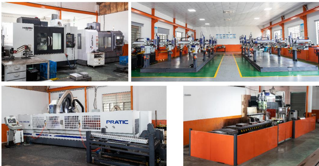
KEFAN Metal parts fabrication plant workshop & Airconditional Assembly workshop.

Website: www.kefanrobot.com . Tel: 0086-13857893619 / Email: info@kefanrobot.com