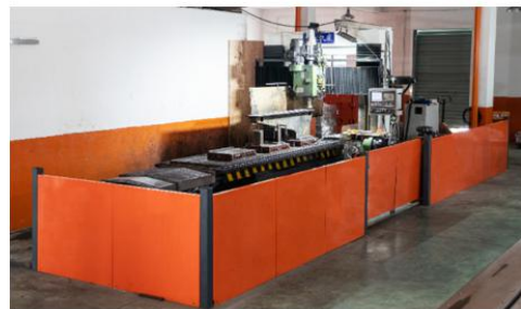
KEFAN Metal parts fabrication plant workshop & Airconditional Assembly workshop.

Website: www.kefanrobot.com . Tel: 0086-13857893619 / Email: info@kefanrobot.com